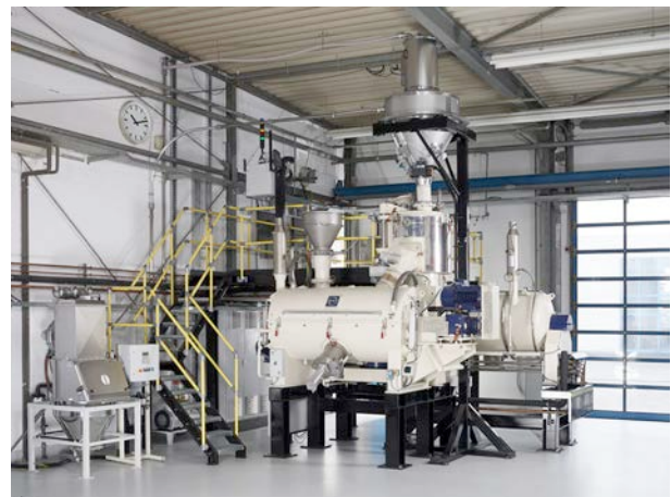
MTI R&D Center in Detmold, Germany

The highly qualified MTI engineers are well prepared to present a tailor-made solution for each process – to fulfill all your requirements to achieve a state-of-the-art quality of your product.