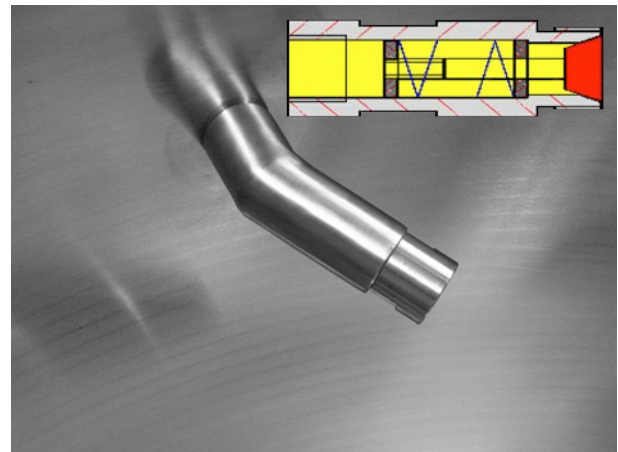
Lance in the vessel wall

In many products and processes liquids with most different material properties and quantities have to be added. The target is to have a directed feed into the vortex with a minimum wetting of the vessel surfaces. This is the only effective way to prevent product stickings caused by an often dusty atmosphere inside the mixing vessel, sticking otherwise possibly having an uncontrolled impact on the mixing result. In its mixer layout thus MTI focused on an addition system directly spraying the fluid into the mixture.